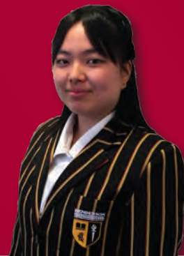
Before I came to New Zealand I looked on the internet to find a safe country where I could study and learn English. I wanted to be at a small school so I would not feel lost in the crowd and it would be easier to fit in. My family were happy that Henderson High School has strict rules about behaviour and academic expectations so I was enrolled. Auckland has many cultures so I would feel included.

My homestay family is busy with 2 small children, it is just like normal family life. We go to play netball at the weekend and enjoy lots of different kinds of food.