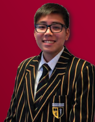
My family and I chose Henderson High School because our friend had studied there in 2013 and recommended it to us. My homestay family are very kind and have a lovely home near school. I have been there nearly 1 year now and really like it. The meals are good and my room is warm and comfortable.

To anyone considering coming to New Zealand to study I would just say "Try it, or you will never know what you can do".