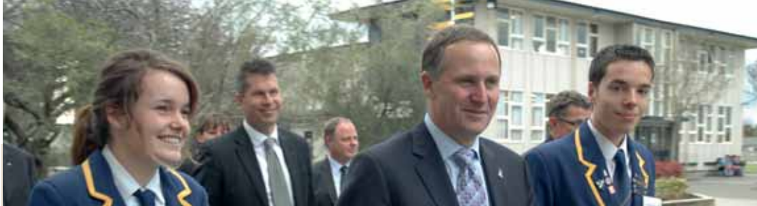
New Zealand Prime Minister Mr John Key visits school